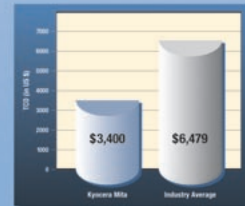
FS-1900 Total Cost of Ownership over 36 months running 8,000 letter size prints per month with a 5% image area. Cost is based on MSRP for hardware and toner. Industry average reflects published pricing for comparable units.

Hardware cost is just one factor to consider when purchasing a Printer. Another more important point is your toner cost and its affect on your Total Cost of Ownership. Our ECOSYS ® technology, long-life Drum and Cartridge-Free design saves you hundreds of dollars over the life of the FS-1900. That's good for you and our environment.